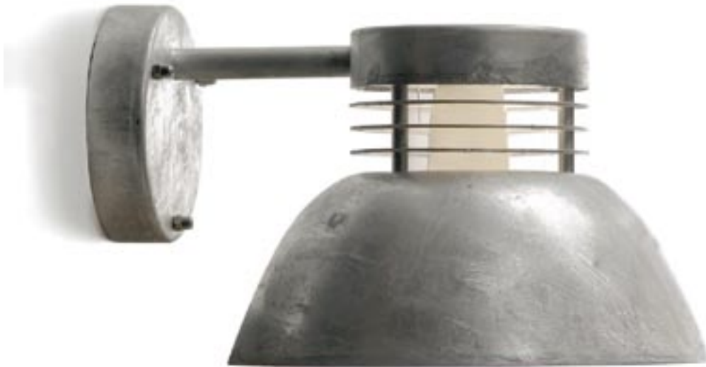
LD824EW-HGS Hot Dipped Galvanized Steel

The outdoor version of the LD824 series. This unit comes in hot dipped galvanized steel. The galvanizing leaves an intriguing random finish that varies from smooth to crystalline. The zinc weathers to a soft gray over time. Available with custom painted finishes over the galvanized for a durable coloured finish.