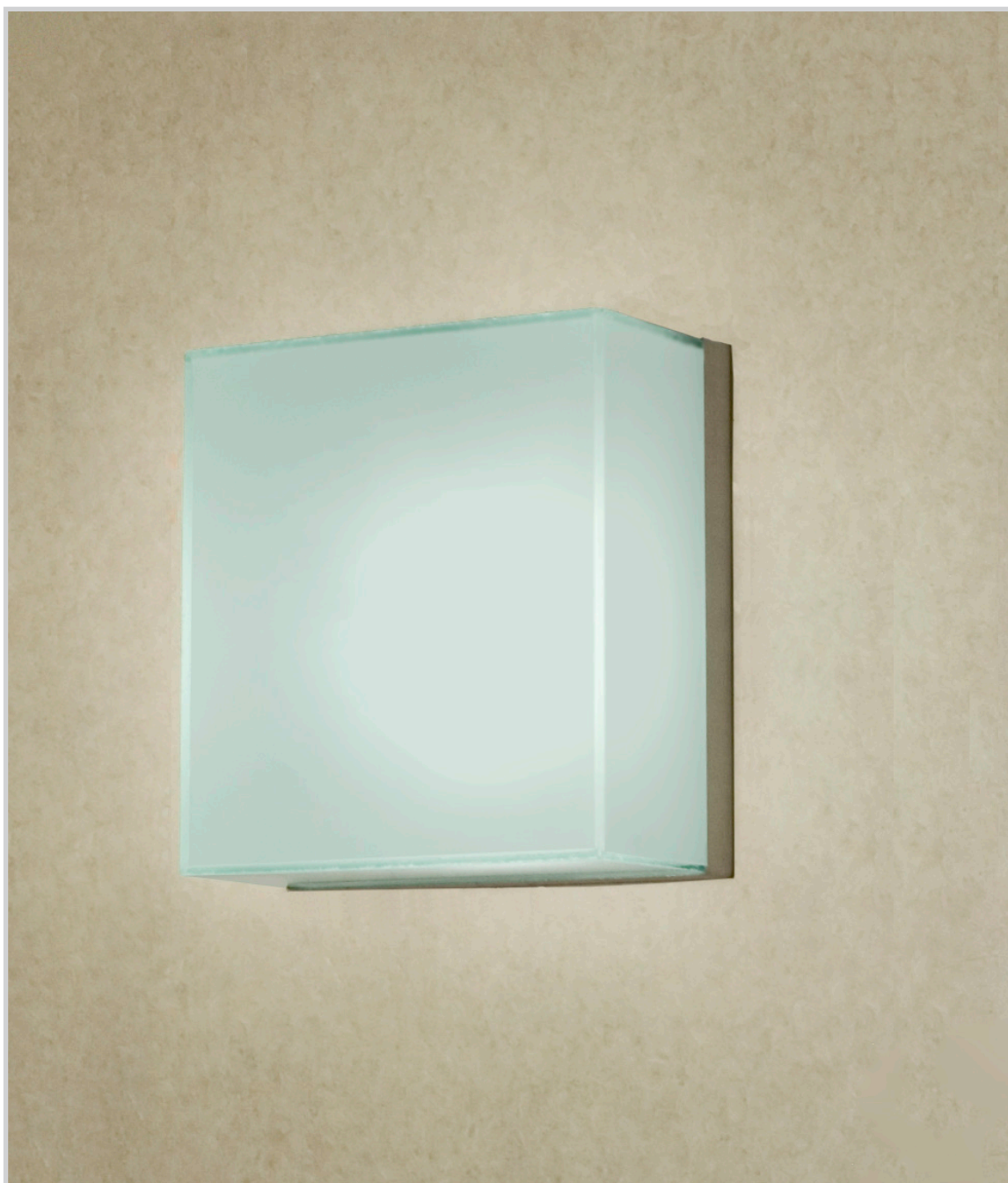
Unique hand fabricated acrylic diffuser with sharp clean lines. Shown with green edge sandblasted acrylic.