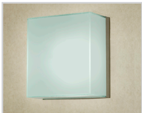
Shown above: A green edged acrylic diffuser.