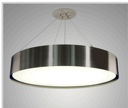
Shown above: Brushed stainless steel and opal acrylic.